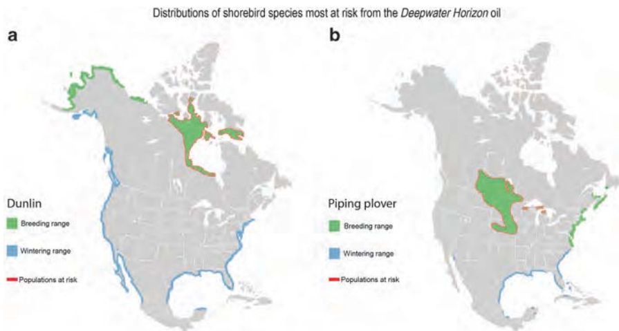
Figure 2. Breeding ground and wintering distributions of (a) dunlin ( Calidris alpina ) and (b) piping plover ( Charadrius melodus ), two shorebird populations assessed to be the most at risk to impacts from the Deepwater Horizon spill through migratory connectivity.